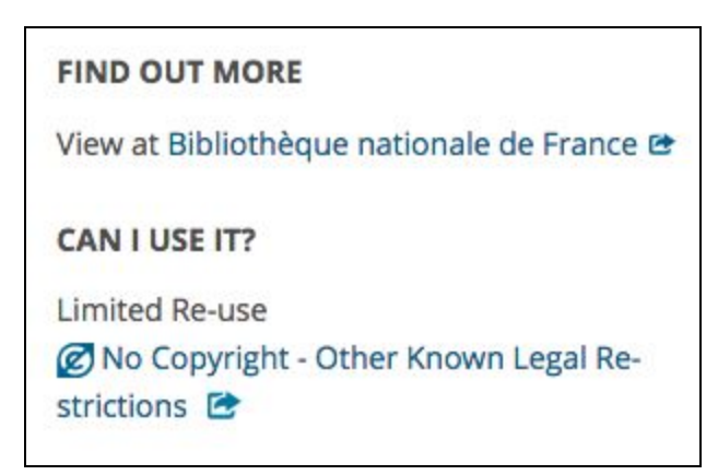
An example of the license link on the item page

For example: http://rightsstatements.org/page/NoC-OKLR/1.0/?relatedURL=[partner license URL here]